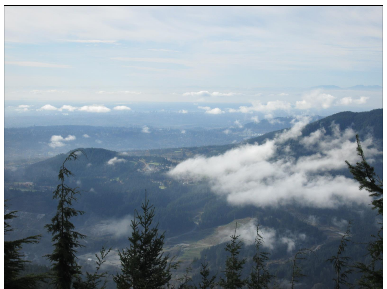
View from the new Coquitlam Lake Viewpoint, looking southwest over the Coquitlam gravel quarry and the Westwood Plateau toward the Fraser River delta.

For the last BMN hike of the 2014 hiking season, a group of fifteen headed out to do the Coquitlam Lake View Trail. After all the rain that our area had received over the past few weeks, we were very fortunate to be treated to a dry day, and with a mostly clear sky to start the day.